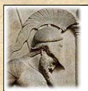
Leosthenes is the faction leader