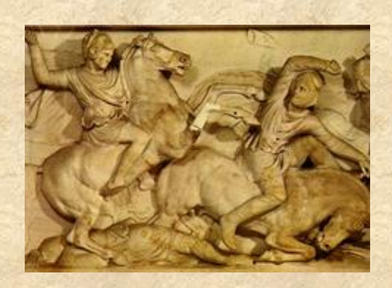
The Worst of the West:

Diadochians will use the Imperial Macedonian list, with some troops drawn from the Rise of Macedon list and allied lists from AtG. The armies are presented with minimums and maximums for this campaign, if players wish they can refer to the guidance lists that were provided before. Teams may not swap units.